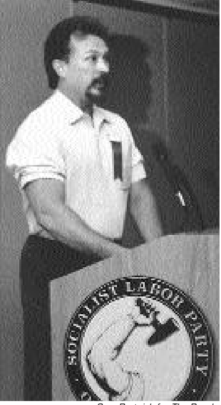
Sam Bortnick for The Peopl

It pointed out that, "Capitalism has always had what Karl Marx called an 'industrial reserve army' to fill its labor needs in periods of capital expansion," and "that even in the best of times it is 'normal' for 4 percent of the workers to be unemployed...."