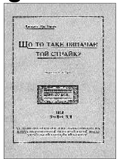
Leon's What Means This Strike?

We created the filing of The People, which is keeping at my flat and each