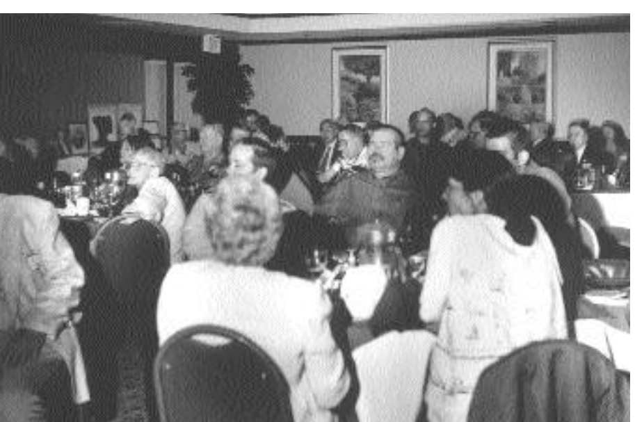
Sam Bortnick for The People

The working class today faces not merely another in the ongoing string of capitalist economic crises in which markets are glutted with commodities that cannot be sold at a profit and masses of workers are laid off, then called back to work. There will be no turnaround to open new jobs or new opportunities for many. Most of those displaced will never find jobs of equal or better pay. What workers face today is a new stage in cap-